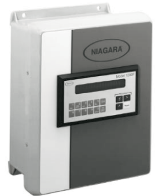
Model 1030FW Indicator/Totalizer